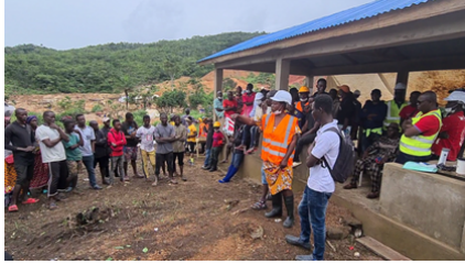
Information meeting at the mercury-free plant.

financed by the BMZ with a co-financing from the EU, supports the introduction of alternative solutions among small-scale miners in Sierra Leone.